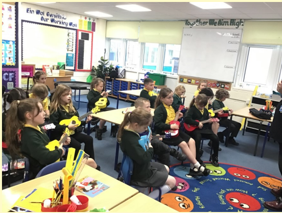
Blwyddyn Alwen loved their visit from Make Some Noise and learnt all about the Ukulele and its origin.